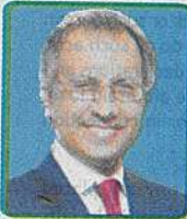
DR. ABDUL HAFEEZ SHAIKH Advisor to PM on Finance