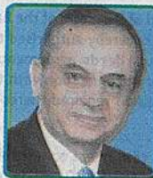
ABDUL RAZZAK DAWOOD Advisor to PM on Commerce & Textile