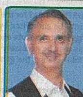
Omar Ayub Khan Minister Energy