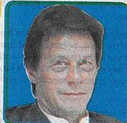
EXCELLENCY IMRAN KHAN Honourable Prime Minister of Pakistan